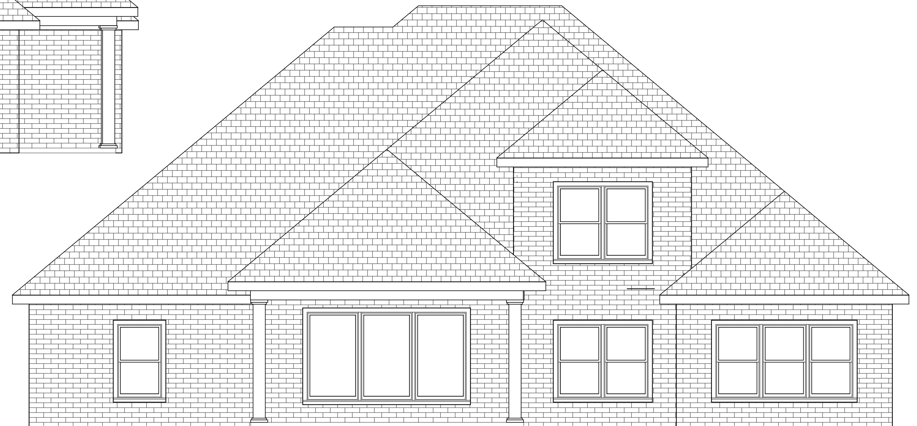
Rear Elevation Scale 1/4"=1'

PLEASE NOTE: Due to the impossibility of providing any personal and/or on-site consultation or supervision and control over the actual construction, and because of the great variance in local building code requirements, building site conditions, and weather conditions, Rick Johnson, Covenant Home Design & Covenant Home Builders, Inc. assumes no responsibility for any damages including structural failures due to any deficiencies, omissions, or errors in the design or prints.