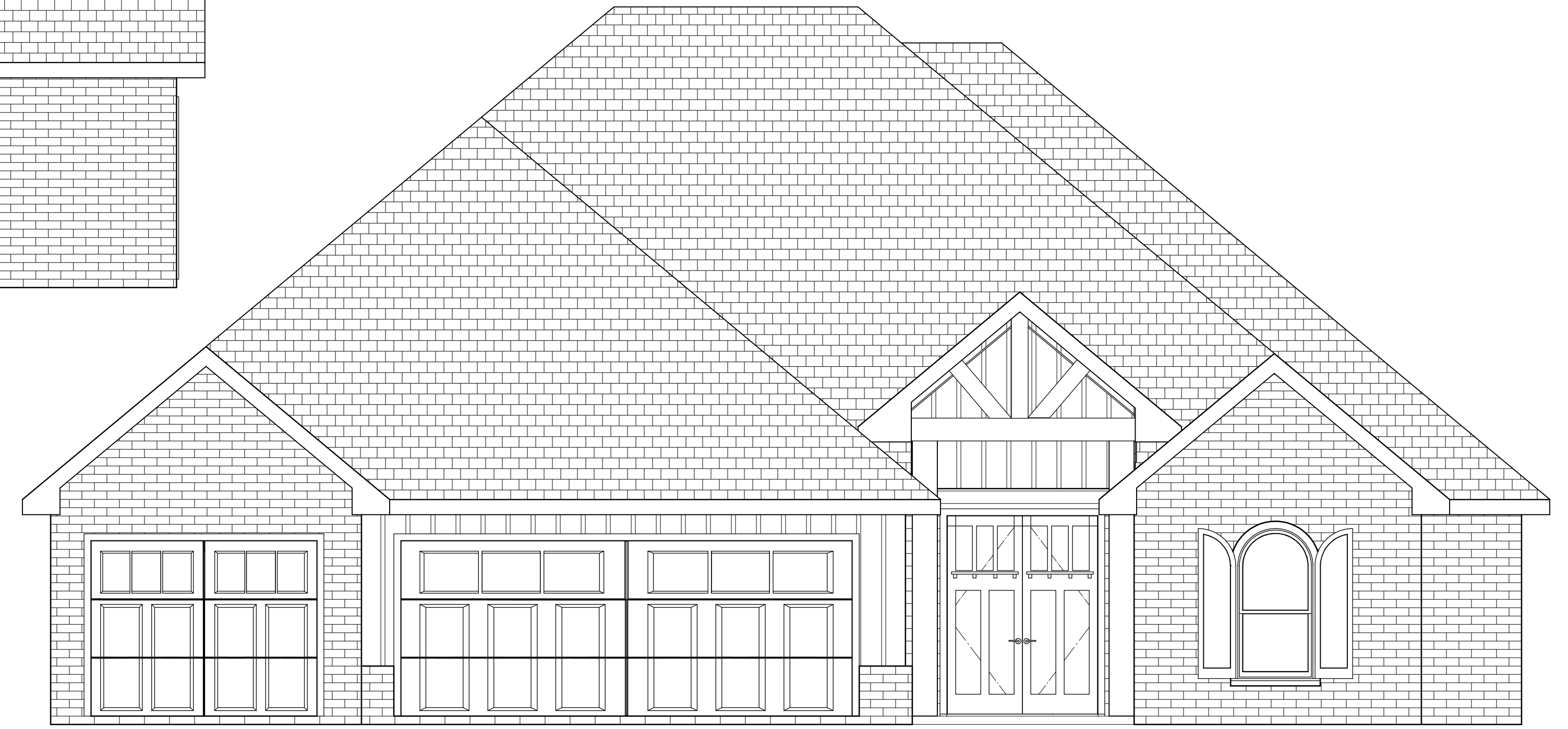
Front Elevation Scale 1/4"=1'